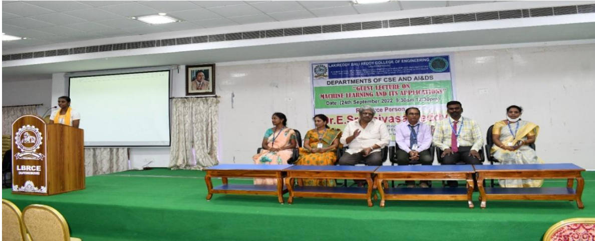
Inauguration Speech by II B.Tech Student

DEPARTMENT OF ARTIFICIAL INTELLIGENCE AND DATA SCIENCE