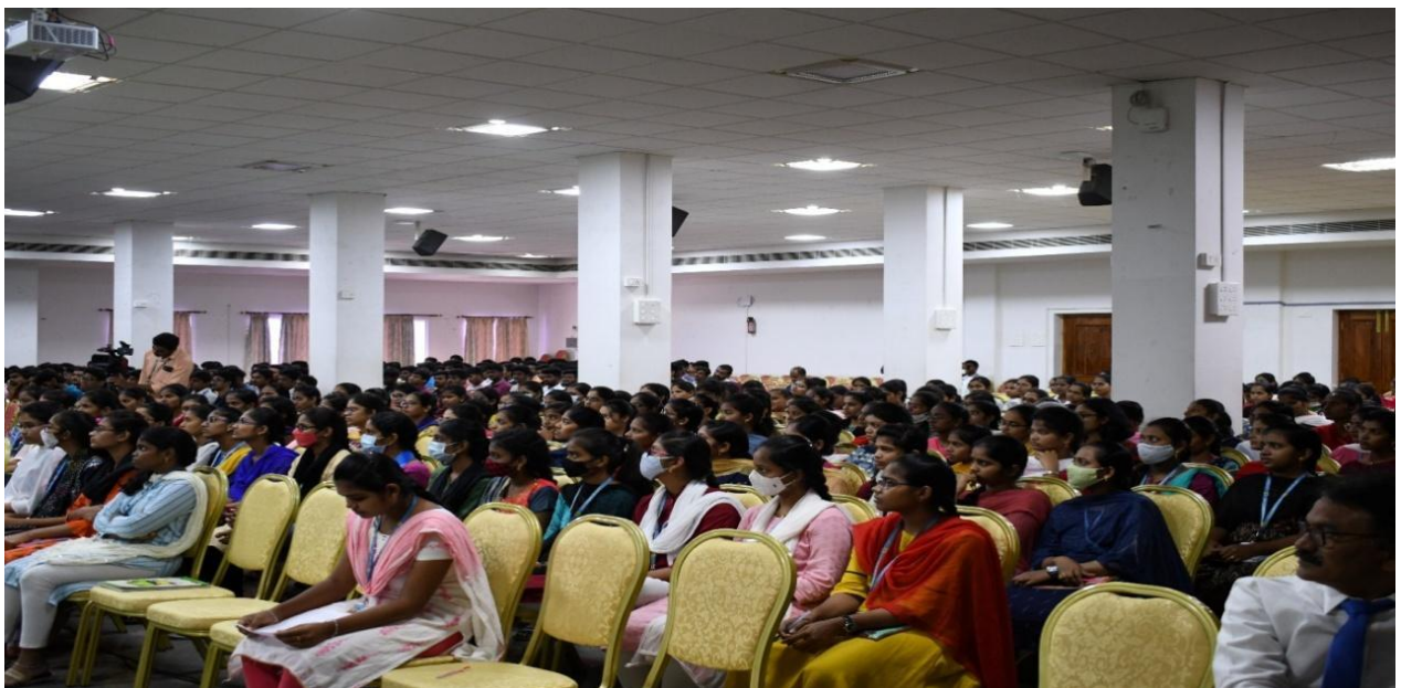
II B.Tech Students